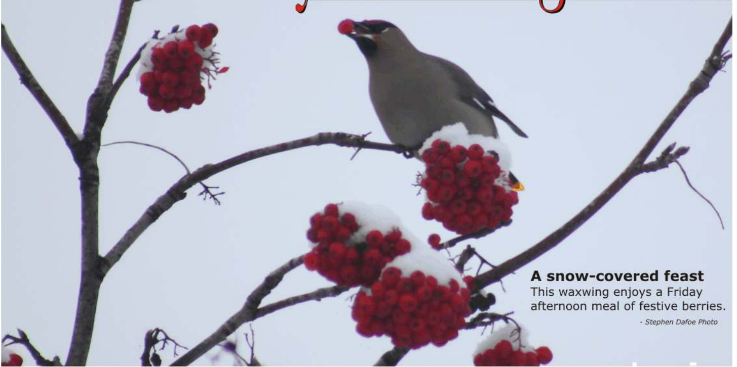
A snow-covered feast This waxwing enjoys a Friday afternoon meal of festive berries.